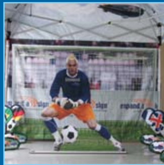
3 CROSS - OVERS