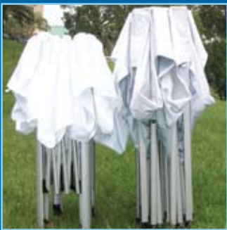
EX - DOME TRADITIONAL GAZEBO