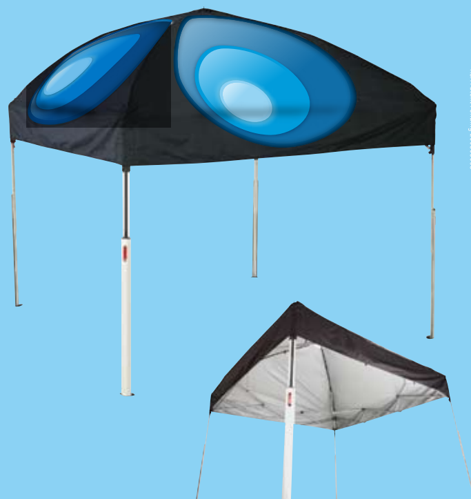
RFI Patent Pending 20080588

Expand a Sign's impressive Ex-Dome with its domed canopy provides more headroom and greater shade cover than a standard gazebo or instant canopy and ensures your branding will stand out from the crowd at any event!