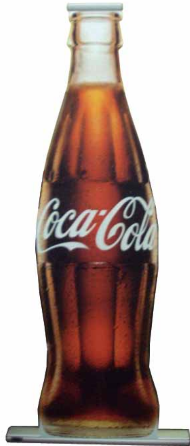
EX-T (CUT OUT)