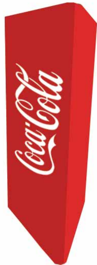
EX-UP HORIZONTAL VERTICAL (TOWER)