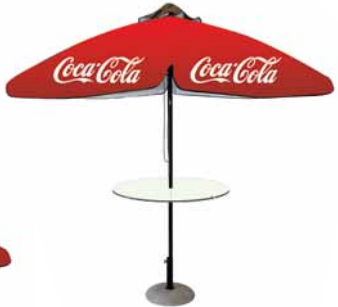
EX-SHADE & TABLE TOP